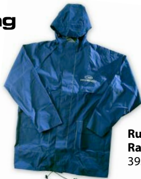
Rubberized Rain Jacket 39.95