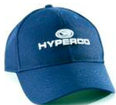
Embroidered Cap 9.75