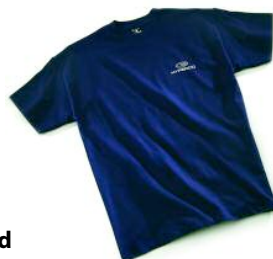
Screen Printed Cotton T-Shirt 17.75