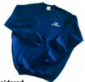
Embroidered Heavyweight Cotton Sweatshirt 29.95